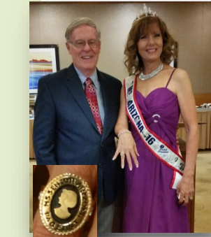
Cameo Ring Presentation