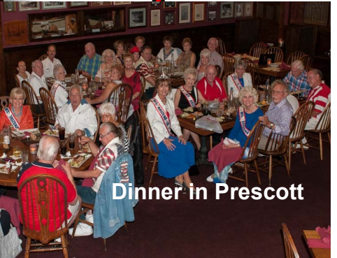
Dinner in Prescott