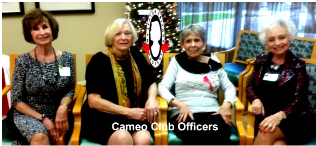
Cameo Club Officers